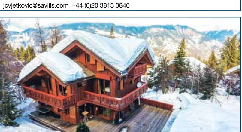
FRENCH ALPS, COURCHEVEL 73120

Magnificent 6 bedroom chalet lacktriangle private setting lacktriangle direct slope access lacktriangle reception room with fireplace lacktriangle spacious terrace lacktriangle games room lacktriangle ski room lacktriangle double garage Price on application