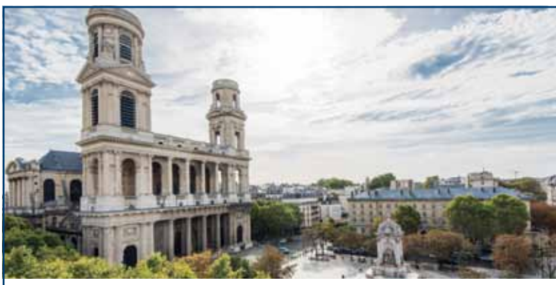
PARIS, PLACE SAINT-SULPICE