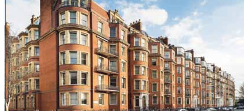
LONDON, KENSINGTON W8

2 reception rooms ◆ 3 bedrooms ◆ study ◆ porter ◆ westerly aspect ◆ corner position